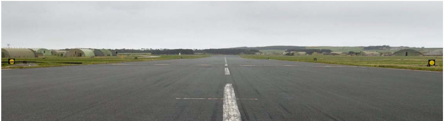
RHAG from threshold

c. Air Traffic Control will pass the state of the cables. Land beyond a rigged approach cable, and aim to turn off before an overrun cable. Similarly, aim to start the take-off run beyond an approach cable and lift off before an overrun cable. This will reduce the available runway length, so adjust your performance calculations to suit. In an emergency, the aerodrome may be able to de-rig a cable for you to make a safe landing, but that may take up to 20 minutes