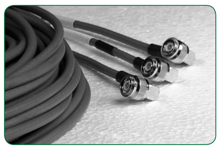
RF Coaxial Cables

EMTEQ proudly offers two families of coaxial cables including low smoke, zero halogen, aircraft grade polyethylene and high temperature polytetrafluroethylene. These designs meet or exceed FAA and OEM requirements. For more information about our coaxial and specialty cable offerings, visit www.emteq.com or call your EMTEQ sales representative.