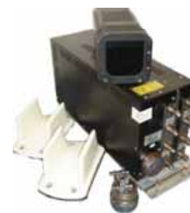
Honeywell KTA870 Cost prohibitive for light GA. No upgrade to ADS-B has been announced.

*According to Garmin GTS8XX AML STC Installation Manual 190-00993-05 Rev.3 Oct 2010