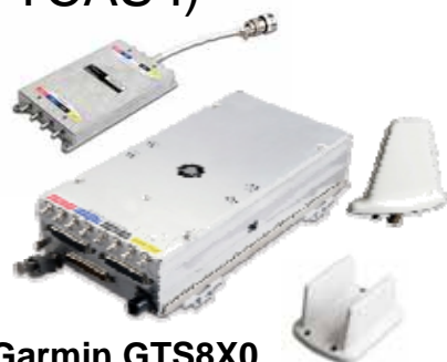
Garmin GTS8X0 Garmin 820/850 uses an external power amp that adds weight and increases installation costs and requires Garmin-branded XPDR.*