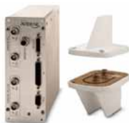
Avidyne TAS600-Series Dual antenna system is smallest, lightest, lowest price, best performing.