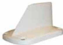
Top & Bottom Antennas