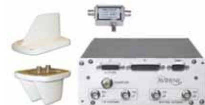
Dual-Antenna TAS600 Series (TAS600/605/615/620)

Provides precision and extended range of ADS-B with the added protection of independent active-traffic system.