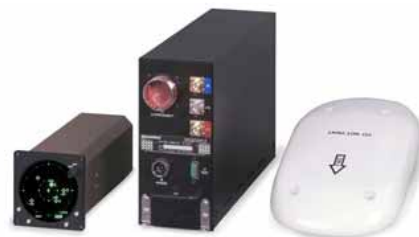
L-3 Skywatch 497 & 899 Single Antenna systems. ADS-B upgrade has been announced for SKY899HP/A models.