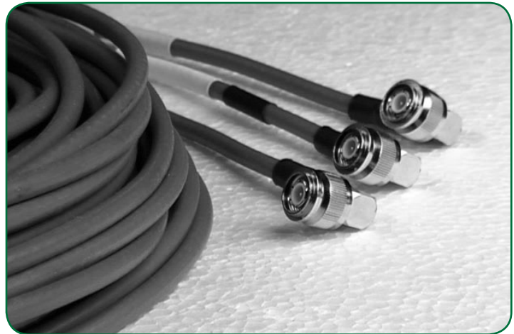
RF Coaxial Cables

EMTEQ proudly offers two families of coaxial cables including low smoke, zero halogen, aircraft grade polyethylene and high temperature polytetrafluoroethylene. These designs meet or exceed FAA and OEM requirements. For more information about our coaxial and specialty cable offerings, visit www.emteq.com or call your EMTEQ sales representative.