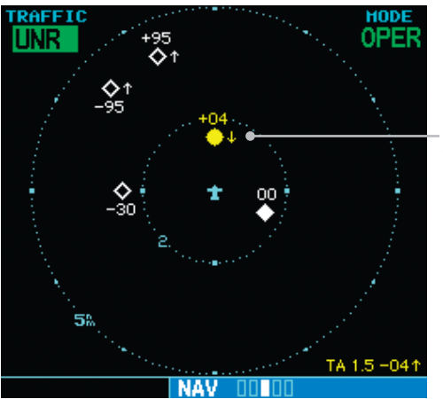
Intruder Altitude and Vertical Trend