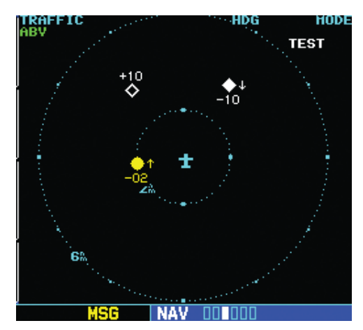
Figure 7 Self-Test Mode

The GTS 8XX Series provides a system test mode to verify the TAS system is operating normally. The test takes ten seconds to complete. When the system test is initiated, a test pattern of traffic symbols is displayed on the Traffic Page. If the system test passes, the aural announcement "TAS System Test Passed" is heard, otherwise the system announces "TAS System Test Failed." For the GTS 850, the aural announcement is "TCAS System Test Passed/Failed." When the system test is complete, the GTS 8XX Series enters Standby Mode. The system may be installed so that the system test is unavailable during flight.