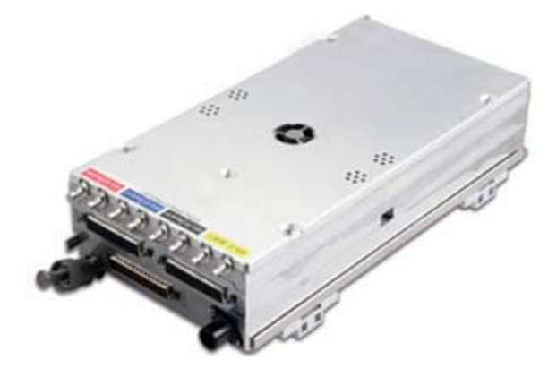
Figure 1 GTS 8XX LRU

The GTS 8XX Series Traffic Advisory System (TAS) and Traffic Collision Avoidance System (TCAS I) uses active interrogations of Mode A/C/S transponders to provide Traffic Advisories to the pilot independent of the air traffic control system. The system also uses passive surveillance by means of an Automatic Dependent Surveillance – Broadcast (ADS-B) receiver which is enabled when installed with an ADS-B link transmit class of equipment.