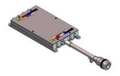
Figure 4 GPA 65 PA/LNA Module

The GPA 65 is a combined Power Amplifier and Low Noise Amplifier module used in the higher power GTS 820 and 850.