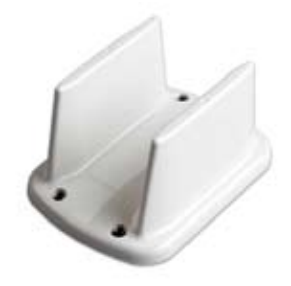
Figure 2 GA 58 Directional Antenna

The GA 58 directional four element antenna is included with the basic GTS system to provide altitude, distance, and bearing of threat aircraft. A single antenna installation uses top-mounted placement. A second GA 58 may be bottommounted to optimize coverage.