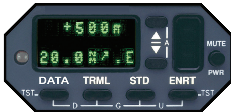
Avidyne ATD150 (optional)

Avidyne's ATD150 'half 3-ATI' Digital Display provides control and display functionality that can be used independently or with a multifunction display. The ATD150 adds a built-in Mute/Update, Approach Mode switch, and an Altitude Alerter function, and provides a compact alternative for displaying traffic threats when panel space is at a premium.