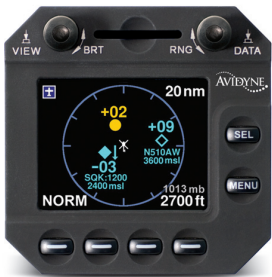
Avidyne MHD300 (optional)

The TAS600 Series provides three levels of alert, so pilots can monitor traffic before it ever becomes a threat. Each of these alerts also provides an altitude separation number and may also include an Arrow pointing up or down denoting that the target is climbing or descending at a rate of 500 feet per minute or greater.