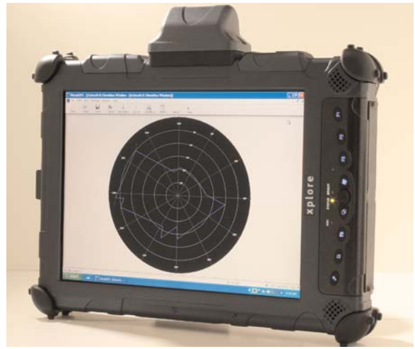
iX104 Tablet with xGPS Module